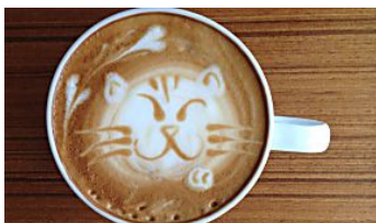
10 Weird And Crazy Traditions In Japan Promoted By LOLWOTLISTS