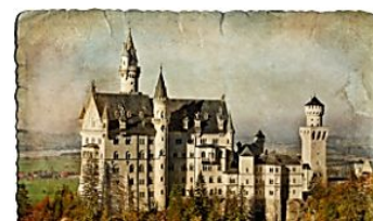
There Are 4 Common Types of German Last Names