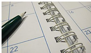
Simple Steps To Create Your Study Plan For Finals