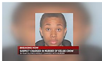
Arrest made in 2015 shooting death of Kelsie Crow