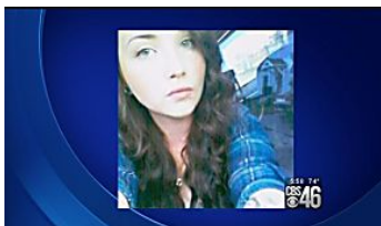
Missing woman's job may have put her in danger